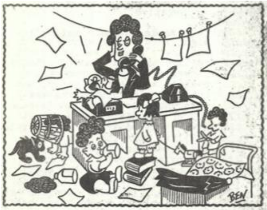
RAISING THE MARRIAGE BAR cartoon from 'RedTape' August 1946

When the statistics for 1970 are looked at more closely, we discover that women made up 40% of the civil service. 31% of the full time employees and 91% of the part time staff were women with 61% of the temporary posts held by women. They made up 99% of the typing staff; 73% of the clerical assistant's and 9% of the home service (Civil Service Statistics, HMSO, 1971, p9). The group with the highest numbers leaving the service were the typing staff with 20.5% leaving in 1969. A high number of permanent staff left between the ages of 20 and 24, particularly women, and again between 60 and 65, particularly men, amongst the clerical grades. Between these age groups there were significantly fewer people leaving the service. (Civil Service Statistics, HMSO, 1971, p36). In 1969 there were 178 women and one man joining as permanent typists. The vast majority of the typing posts were classed as temporary with 39 men and 6,201 women joining in 1969 (Civil Service Statistics, HMSO, 1971, p54).